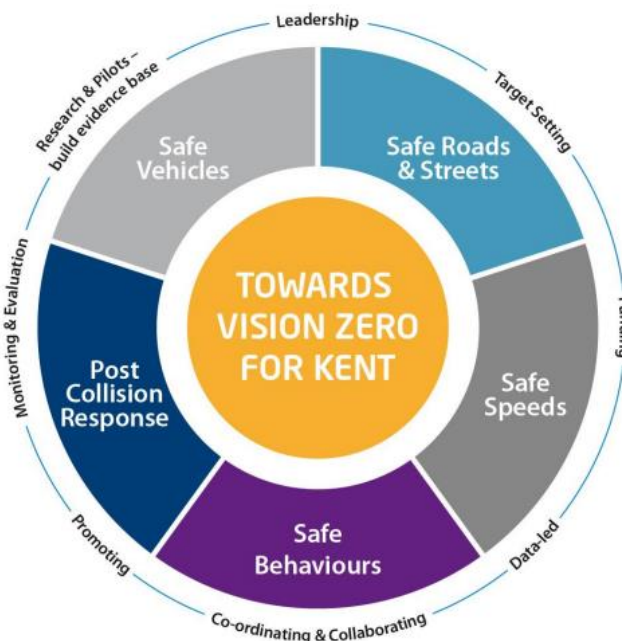
Diagram 1: The Safe System